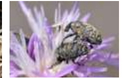
Above: Larinus minutus . Below: Cyphocleonus achates .